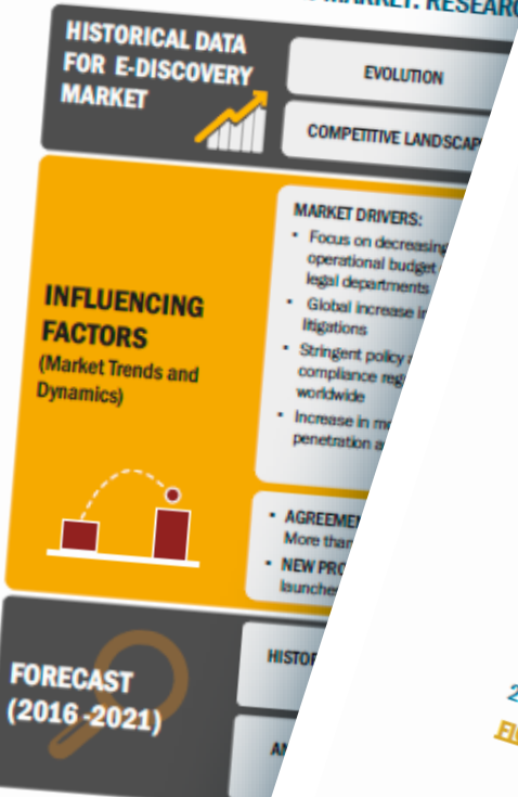
FIGURE 2 E-DISCOVERY MARKET: RESEARCH METHODOLOGY

This research study involved the usage of extensive secondary data sources such as Hoovers, Bloomberg Businessweek, Factiva, and OneSource. This technical, market-oriented, and commercial study of the market was conducted by mainly several industry experts from core and related industries, distributors, service providers, technology developers, all of this industry's value chain. In-depth interviews were conducted with key industry participants, subject matter experts, industry consultants, among other experts, to obtain information as well as to assess future prospects. The research methodology applied in making this report