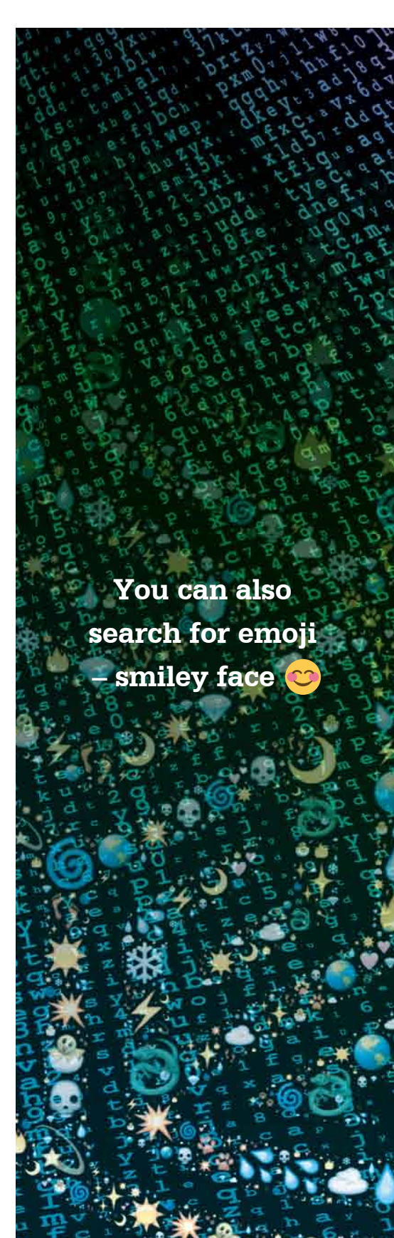
Article contributed by dtSearch®

dtSearch has enterprise and developer products that run "on premises" or on cloud platforms to instantly search terabytes of "Office" files, PDFs, emails along with nested attachments, databases and online data. Because dtSearch can instantly search terabytes with over 25 precision search options, many dtSearch customers are Fortune 100 companies and government agencies. But anyone with lots of data to search can download a fully-functional 30-day evaluation copy from dtSearch.com